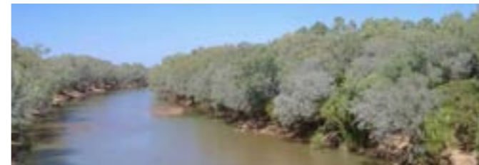
The mighty Fitzroy River in the dry season