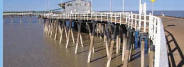
Local attractions include the Derby Jetty

A wide range of general interest and accredited programs area available. Madjulla Inc draws on a wide network of Aboriginal people with specific knowledge and expertise in Nyikina language, culture, and contemporary issues.