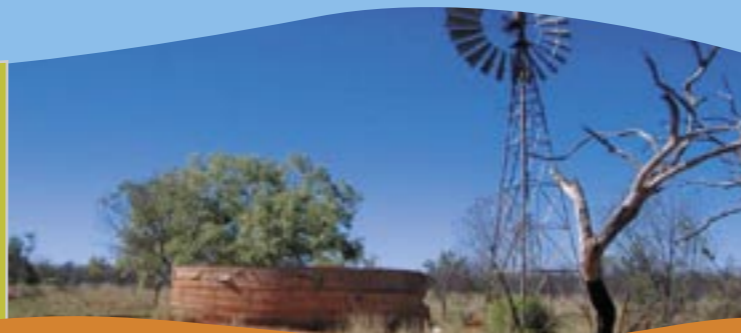
Pastoral heritage along the bush tracks

Experience the lifestyle and traditions of the Nyikina People